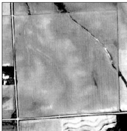
Figure 2. Aerial black and white photo of a 160-acre field in Moody County, South Dakota.

Remote sensing: Multispectral remote sensing or black and white aerial photographs offer the potential to identify, categorize, and determine differences and similarities in crop and soil conditions over a wide geographic area. Images can be taken several times over years to give views of whole fields, farms, and watersheds. In many cases, interpreting a simple black and white aerial photograph will suffice in determining the variability of soils across a field ( Figure 2 ). Soil color may be related to organic matter content of the soils. Typically, light areas have lower organic matter content than dark areas. The amount of organic matter influences agro-chemical application rates, plant available water, and soil