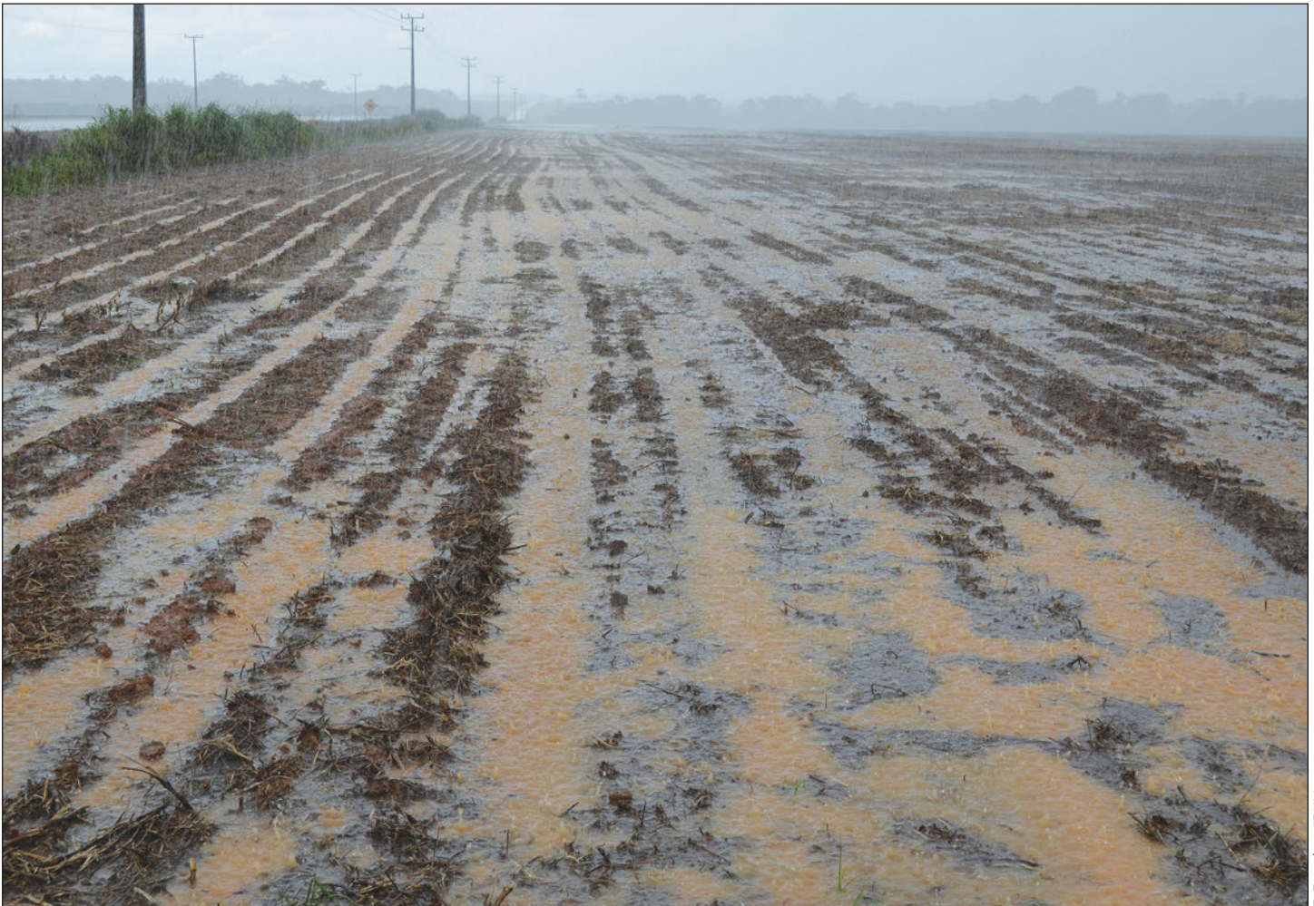
Runoff happens – even in the well-drained Oxisols of the tropics.

If P fertilizers are broadcast, soluble and particulate P will accumulate at the soil surface leaving a larger portion susceptible to reaching water reservoirs through runoff—even in the Oxisols of the tropics. When applying P fertilizer in-furrow, the chance of P movement with runoff decreases significantly because it is incorporated deeper into the soil. Local research is always necessary to establish the potential risks of the different methods of P placement to runoff.