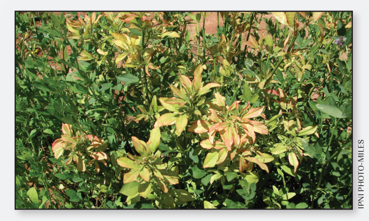
Boron deficiency in alfalfa is often seen in drought conditions.

listed above controlling soil availability. Plant analysis and visual symptoms are often more useful as diagnostic tools than soil testing.