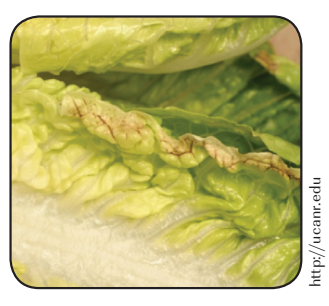
Tip burn in romaine lettuce is associated with inadequate calcium uptake.