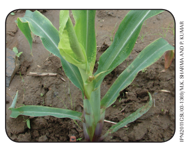
Stunted development of growing point of corn is caused by calcium deficiency.