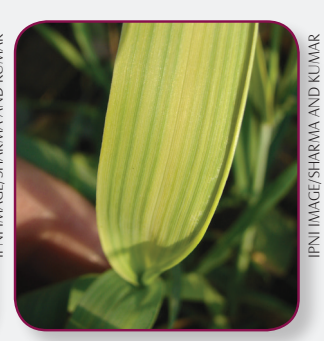
Iron deficiency in soybean (left), sorghum (middle), and wheat (right).