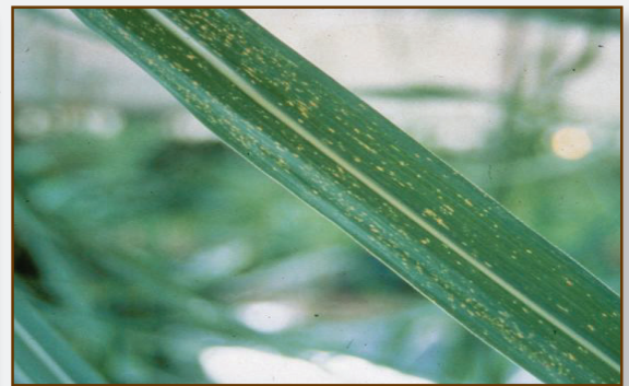
Figure 2. Leaf freckling is a symptom of low Si in sugarcane receiving direct sunlight. Silicon is thought to act as a filter for harmful UV radiation.