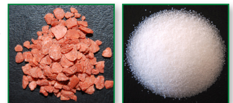
Potassium chloride is found in various shades and particle sizes.