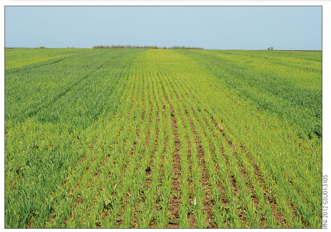
Nitrogen is the plant nutrient that most commonly limits crop growth and yield. A lack of N is often visible by stunted growth and pale green leaves.