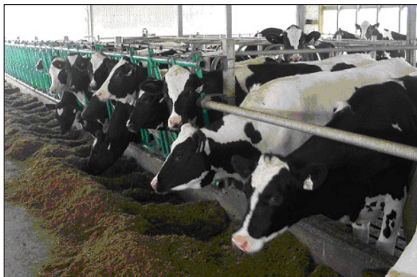
Large amounts of nutrients cycle on dairy farms.

Fertilizer management influences greenhouse gas emissions as well. Nitrogen fertilizer manufacture emits carbon dioxide, and adding N to soils can increase emissions of nitrous oxide. On the other hand,