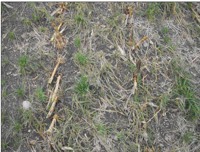
Cover crops can help reduce risk of nitrate leaching, improve soil fertility, increase soil organic matter, and minimize surface runoff and erosion.

The choice of source is influenced by the need for nutrient elements that accompany the main nutrient. Common sources of N include anhydrous ammonia, urea, urea-ammonium nitrate, ammonium sulfate, ammonium nitrate, and potassium nitrate. Urea is prone to volatile losses of ammonia when surface-applied, especially when soils are