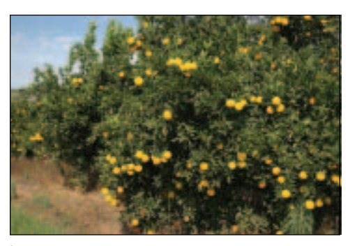
Lower N and higher K application rates are usually best if fruit is intended for fresh market, while higher N and lower K rates may be more appropriate for frozen concentrated orange juice market destinations.

Fruit yield may also be negatively impacted by excess. An experiment conducted in a commercial Murcott tangor (Honey Tangerine) grove found that fruit yield (average for six harvests) was reduced by 53% as K application rate increased from 25 to 225 kg/ha. Trees that received the highest K rate had excessive defoliation and decreased calcium (Ca) and magnesium (Mg) contents in the spring flush of leaves