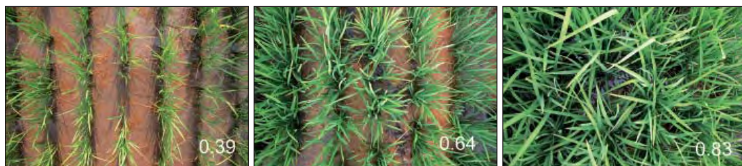
Figure 2. Example digital images. Left to right: low pre-flood N to high pre-flood N, collected at R1 growth stage with a digital camera in rice plots. Values in the lower right corner of photos were the proportion of green pixels in images.

Abbreviations and notes for this article: N = nitrogen;