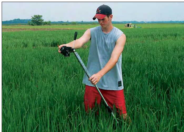
Figure 3. Collecting a digital photo for percentage green pixel analysis.