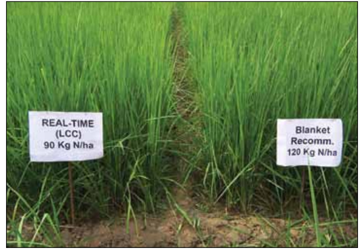
Blanket N recommendations cannot achieve the N use efficiency of realtime split applications based on monitoring.

ed by amount of N fertilizer applied (Snyder and Bruulsema, 2007) is plotted as an average for each treatment across sites in Figure 1 . Real-time N management performed the best, while the fixed-date variable N rate application appears to hold promise despite needing further refinement. These results are in-line with those reported by Varinderpal-Singh et al. (2007) and Yadvinder-Singh et al. (2007) from other on-farm locations in Punjab. Although yield levels obtained by following the