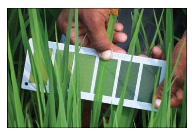
This is an example of the 6-color LCC used in gauging rice leaf color.

initiation around 42 DAT and applying fertilizer N as guided by the leaf color ... all critical growth stages requiring a sufficient supply of N. Applications of fertilizer N can be adjusted upward or downward based on leaf color, which reflects the crop's relative need for N. We conducted on-farm trials during two rice seasons to evaluate both approaches relative to the blanket recommendation and farmer practice of applying fertilizer N to rice.