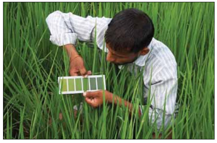
The LCC is gaining in popularity as an inexpensive tool for estimating leaf N content and managing fertilizer N in rice.

fixed-date variable rate strategy were similar to those recorded for real-time N management, the former allowed application of either 100 or 115 kg N/ha compared to the 60 to 120 kg N/ ha range in the latter. This suggests that fixed-date variable N application, as was designed in this study, needs to be modified to allow for N application across a wider seasonal range. It is proposed here that this can be done either by introducing the element of variable rate N application at the 21 DAT stage or by including another date for fertilizer application as per leaf color just before flowering (around 60 days).