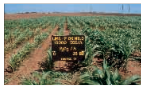
GRAIN SORGHUM , like wheat, responds to starter P on acid (pH 4.6), high P soils. Plants on the right received 35 lb P_2O_5/A banded in direct seed contact. Banded P helps lower Al toxicity in the vicinity of the seedling.

calcium carbonate (ECC)/A rate had been applied.