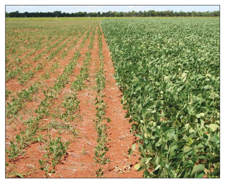
Dramatic contrast between two soybean fields where the only difference was the lack of application of P and K in the first year of production in a typical clay Cerrado soil in Mato Grosso State, in the Midwest region of Brazil.

such as enzyme activation, water and energy use relationships, translocation of assimilates, and protein synthesis. So, a short K supply causes a large number of problems in the plant.