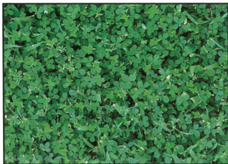
PHOSPHORUS fertility may be a key to establishing and maintaining annual lespedeza.

forage yields averaged 3,125 lb/A, shown in Figure 1 . Yields increased 1,000 lb/A by application of 40 lb/A P_2O_5 and reached a maximum of 5,355 lb/A with application of 120 lb/A P_2O_5 . Seed yields showed similar increases in response to applied P, indicated in Figure 2 . Seed yields increased 110 lb/A with 40 lb/A P_2O_5 and reached a maximum of 635 lb/A at 120 lb/A P_2O_5 .