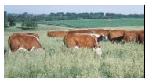
Bromegrass makes high quality pasture for beef cattle.

Another interesting facet of this work was the response to S fertilizer. The addition of 20 lb S/A increased forage yields by 400