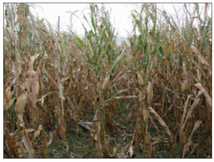
The corn leaves in the left rows received no K fertilizer and appeared dull gray-green, while the leaves in the right rows with K application were still green.

Cl. Stalk rot was reduced with the addition of K, regardless of source.