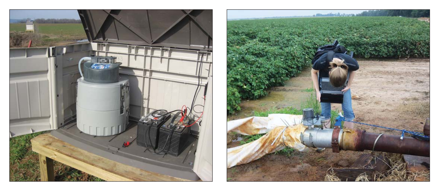
Automated sampler collects water during runoff at Atkins, Arkansas (left) and in-line water flow meter for irrigation water input (right), at Dumas, Arkansas.