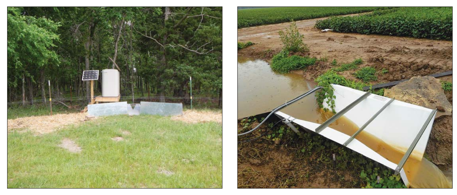
Flumes to measure discharge from fields near Wedington, Arkansas (left) and Dumas, Arkansas (right).

allow for the determination of "tail water" losses from irrigation and/or rainfall.