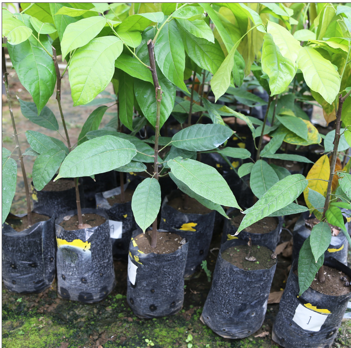
One of the four full fertilizer treatment replicates with 50 top grafted cacao seedlings.

Most nurseries in the region will not use fertilizer at all. Hence, our “zero fertilizer control” treatment represents the usual practice. Nurseries try to reduce costs where possible. On the other hand, previously accepted “best practice”, which has the addition of SP36 (double superphosphate) in the planting media, combined with the use of foliar applications, has been used and is still used where a premium product may be sold. Our nursery “cocoa carer”, Mr. Aris, was impressed by the single fertilizer rate results when compared to the previously accepted “best practice.” The consensus was that the fertilizer treatment gave much better results. An initial analysis suggests that the fertilizer treatments cost much less for materials and labor than the accepted “best practice.” Specifically, the application frequency was reduced to three soil-based fertilizer application rounds, compared to one soil and up to ten foliar applications performed in the previously accepted “best practice.” The nursery of Mr. Aris has already started to incorporate the practice, which gives practical support for our conclusions. BC