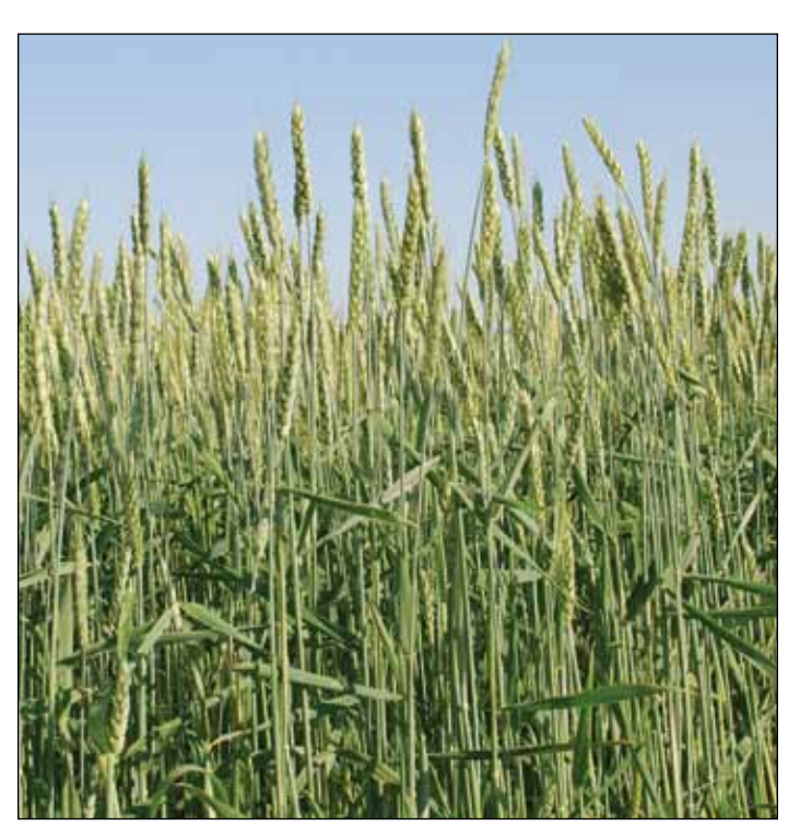
Spring wheat is grown on millions of hectares of land in Siberia, but yields in recent years have averaged only about 1.3 t/ha.

low to very low in available P (Figure 1). The lowest content of P (low and very low classes) is observed in soddy-podzolic soils (57%), and in southern chernozems and chestnut soils (40%). Most soils (79%) have high to very high contents of available K (Figure 1). Taking into consideration the status of soil nutrients in Siberian soils, annual recommendations for cultivated crops include N on 16 M ha, P fertilizer on more than 10 M ha, and K fertilizer on 5 M ha.