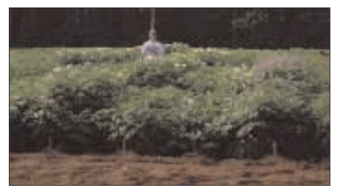
Potatoes produced in Prince Edward Island have variety-specific P needs.

Although soil test interpretations have changed over time, these soils were generally in the range considered to be medium to high in P. These experiments have confirmed the high P requirement of Russet Burbank grown on such soils. In addition, the lesser response of