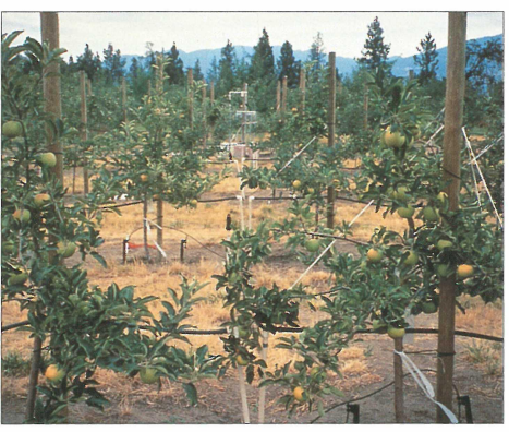
HIGH DENSITY apple orchard with dwarf rootstock showing a drip irrigation system in southern British Columbia, Canada.