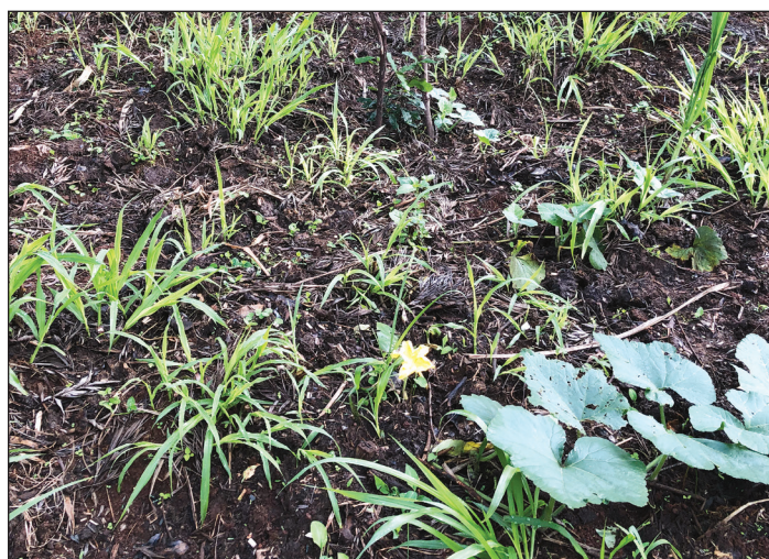
Examples of in-row and surface application of cattle manures in sub-Saharan Africa.

of the main causes of these surpluses is the large amount of P imported in feed coupled with low P use efficiency of most livestock. Therefore, there is often a clear relationship between livestock density and P balance at the farm level.