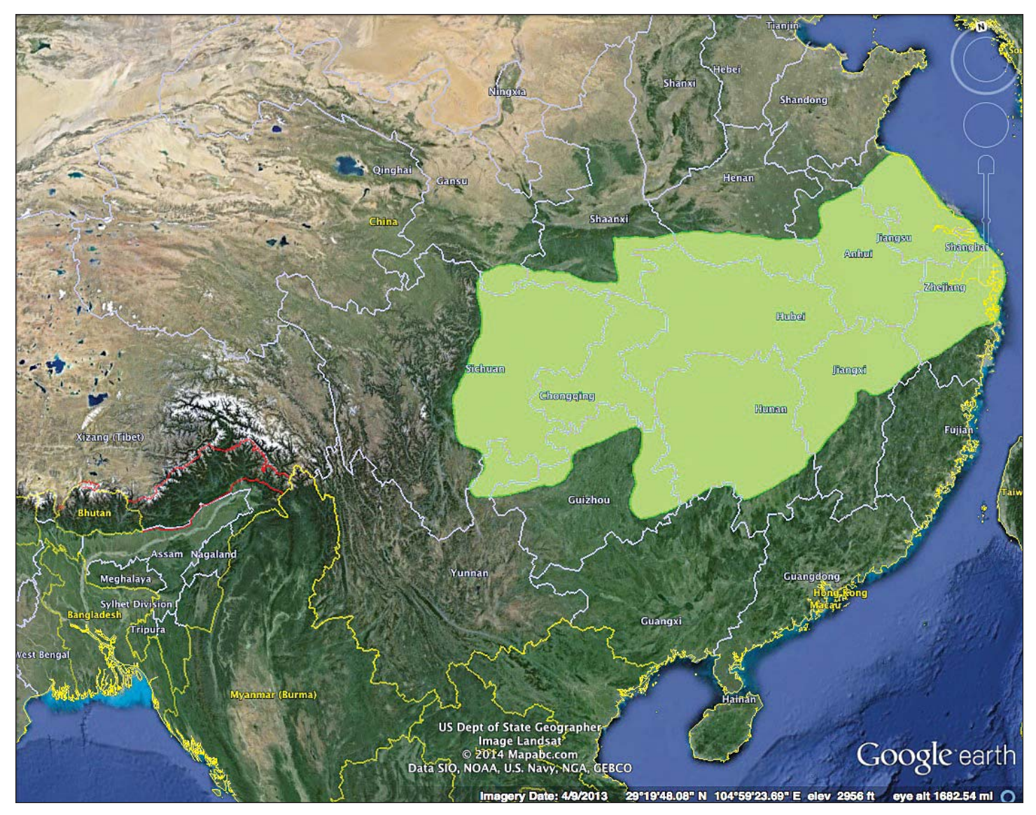
Entire Yangtze River Basin area within China.