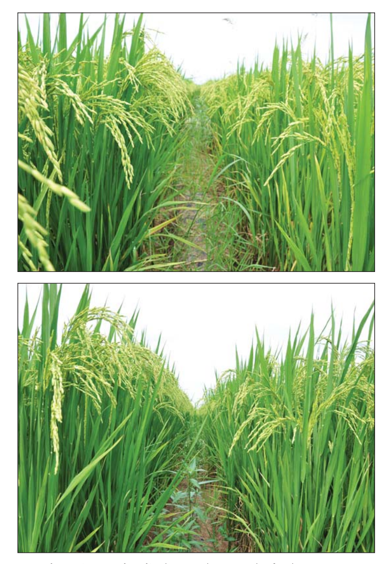
Comparisons at a low soil K site showing the general K fertilizer recommendation (top left), the zero K check (top right), K plus Straw (bottom left), and K minus Straw (bottom right).

Abbreviations and notes: N = nitrogen; P = phosphorus; K = potassium; NH_4Oac = ammonium acetate.