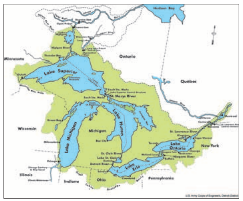
Ohio , Michigan , and Ontario have the largest agricultural areas in the Lake Erie drainage basin, which is part of the larger Great Lakes watershed.

Over time, livestock have become more productive, partly by increasing feed conversion efficiency, and partly by increasing the output of meat, milk, and eggs per head. Some animals are now raised to higher weights than in the past; others are raised to market weight more quickly (e.g. more cycles per year for broilers). Feed conversion efficiency improvements lead to less manure excretion per unit of production, but other sources of productivity improvement increase manure excretion per unit of inventory.