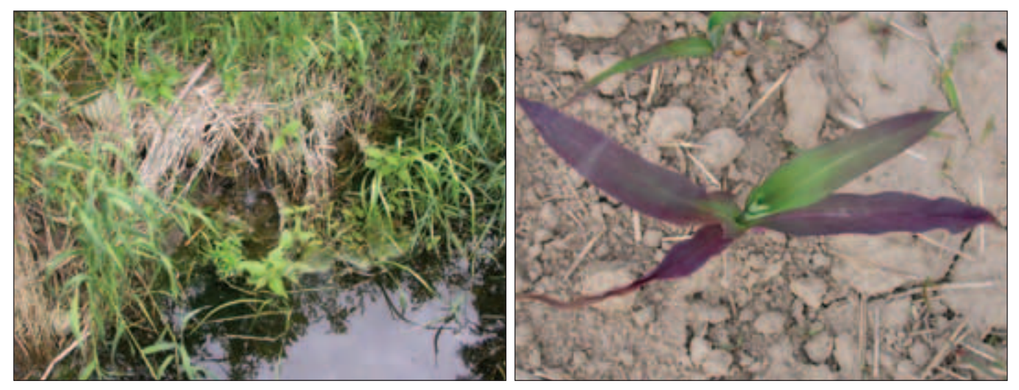
Balancing between the extremes of excess algae in drainage water and crop P deficiency requires careful attention to BMPs

2 of the past 11 years. Estimated either way, P inputs greatly surpassed removals prior to 1990. Since P is strongly retained in soils, much of the surplus P has likely contributed to a buildup in soil P fertility. The improved P fertility has benefited crops. When soils are low in P, recommended rates of application often exceed the removal rate. At somewhat higher soil test levels, applications that do not exceed crop removal suffice for optimum crop yields, while soils with even higher soil test P levels can produce optimum crop yields with little or no P inputs.