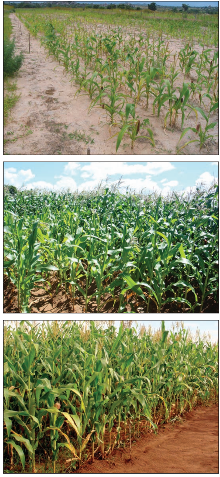
Differences in response to fertilizers under low (top photo), medium (middle), and high soil fertility conditions.

Intercropping maize with grain legumes offers opportunities to improve overall productivity of both crops, and