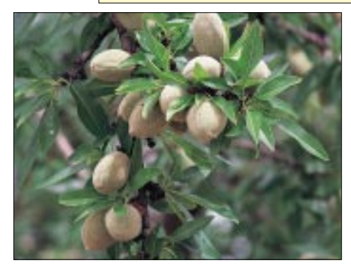
Almond production requires substantial amounts of K, and deficiency can reduce future yield potential.