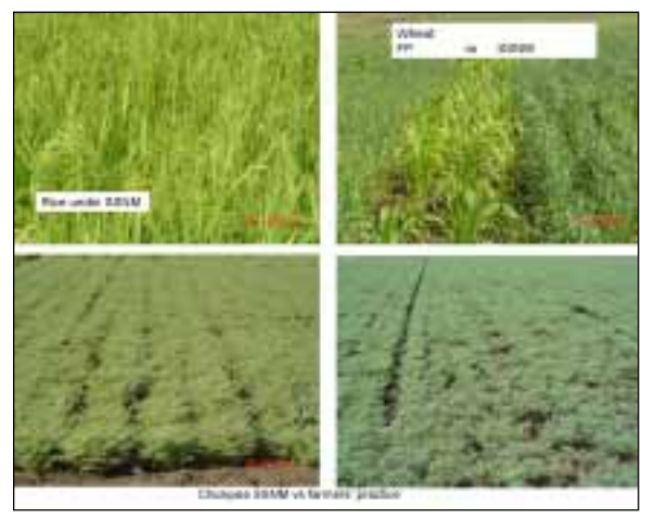
Photo at top left shows rice in SSNM plot. Photo at top right shows wheat with farmers' practice compared to SSNM. Lower photos show chickpea, SSNM at left and farmers' practice at right.