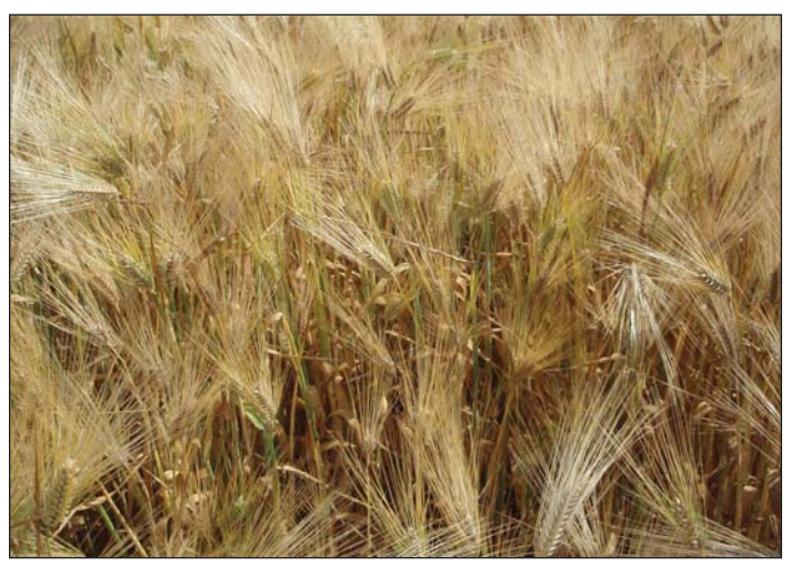
Winter barley (shown) and winter wheat provide half of the cereal grain output in southern Russia.

Potassium chloride fertilizer increased DM accumulation in winter wheat and winter barley through all stages of crop development ( Table 3 ). The increase in DM yield of the sec-