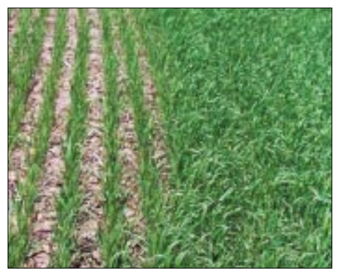
Early-season response of spring wheat to seedplaced P is shown at right in the photo, compared to wheat with no P at left.

While increased rooting is an important factor in improved P access under conditions of a limited P supply, there are other plant responses to restricted P supply that can increase the accumulation of P in the plant. Some plants release phosphatases into the growth medium to break down organic phosphates, increasing the supply of available P. Plants such as canola can acidify the rhizosphere through secretion of organic acids to increase P availability. Some plants may also respond to P deficiency by increasing their ability to accumulate the P that they contact. In corn, a decrease in P level in the plant appears to signal the roots to absorb P more rapidly. Plants which have experienced P stress show a great increase in rate of P uptake when they come in contact with P as compared to plants that have not experienced P stress. The higher rate of