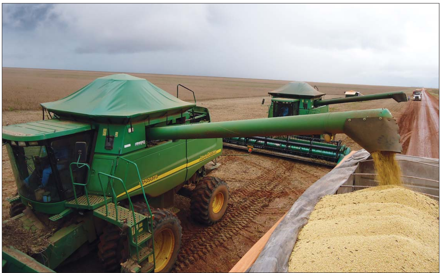
Soybean harvest in Mato Grosso: its production leads nutrient use in Brazilian agriculture.

context, educational initiatives aimed at educating farmers and agronomists on how to assess the best performance of nutrient inputs are crucial to promote fertilizer use efficiency, minimize nutrient loss, and increase crop production sustainability.