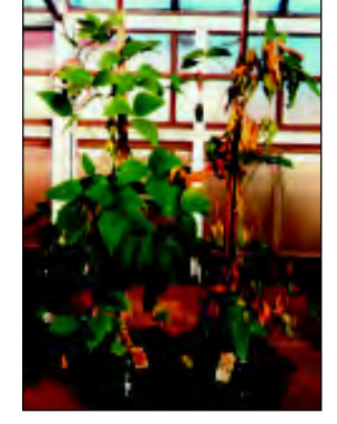
Photo 7. On the left are soybean plants inoculated with Diaporthe phaseolorum , showing tolerance to stem canker with 60 kg K<sub>2</sub>O/ha (base saturation index of 40%). At right, severe symptoms of stem canker are shown in inoculated control plants.