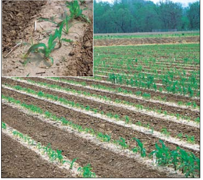
In-furrow N-P starter fertilizers offer several advantages for corn on sandy loam and silt loam soils in Louisiana.

Fifteen trials were conducted between 1991 and 2005 at the Northeast Research Station near St. Joseph, Louisiana, to evaluate the effectiveness of in-furrow starter fertilizers. Some of these experiments included variables other than starter fertilizer. However, for this summary, only the main effects of starter fertilizer are reported.