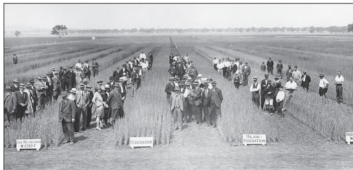
Longerenong College open day in 1930, putting new cultivars in front of farmers.

No estimates were made for free living N fixation, non-biological N inputs, N leaching, N volatilization, or N lost in soil erosion. The N_2 fixation for the pea phases were estimated using the peak biomass for peas from the pea grain yield, as-