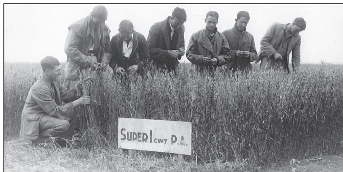
Longerenong College was one of the first places in southeastern Australia to trial superphosphate for grain production.

There was no baseline soil archived when the experiment was established 90 years ago, and so a “fence-line” sample was taken in an uncultivated area adjacent to the site. The soil N and C values (top 10 cm) measured then are in general agreement with the estimated N decline from the mass balances. While it is not possible to fully analyze these data due to the nature of the experimental design, there is an indication that C:N ratios are higher for rotations that