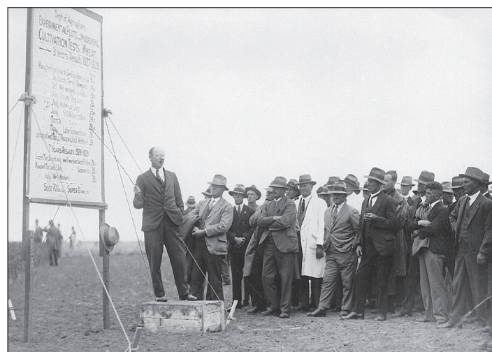
LR1 has a history of providing lessons to farmers and scientists. This photograph was taken at the annual field day in 1930.

LR1 is Australia's longest running annual cropping system experiment, established in 1916 on a self-mulching, alkaline Grey Vertosol near Horsham in southeastern Australia. Average annual rainfall is about 420 mm. LR1 sought to identify what crop sequences would provide improved yields and over time it has become a platform for other research such as on the use of superphosphate. The experiment compares seven cropping rotations and although not spatially replicated, each cropping phase is present every year. The rotations are continuous