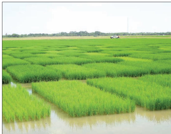
Variety x N trial at the LSU AgCenter Rice Research Station, Crowley, Louisiana.