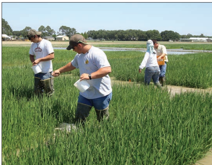
Midseason N fertilization at panicle differentiation stage, LSU AgCenter Rice Research Station in Crowley, Louisiana.