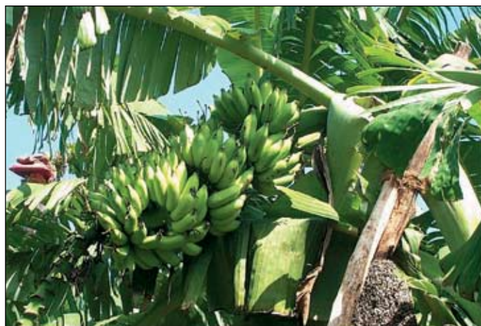
Banana plant in bearing stage, sprayed with SOP.

The experiment was conducted with Neypoovan banana, using a randomized block design with four treatments ( Table 1 ). Plants were sprayed twice, initially after the opening of the last hand (i.e. 7th month after planting), and 30 days later. The entire plant canopy was sprayed including the developing bunches. Due to the waxy nature of the leaf surface, a wetting agent (APSA 80) was included at 2 ml per 10 L of