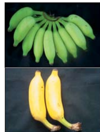
Second hand from SOP-sprayed bunch at top. Below: Fingers from SOP-sprayed bunch.

Foliar SOP spray improved final fruit yield and net income ( Table 4 ). Steady increases were obtained as spray concentration increased. The 1.5% SOP treatment was most