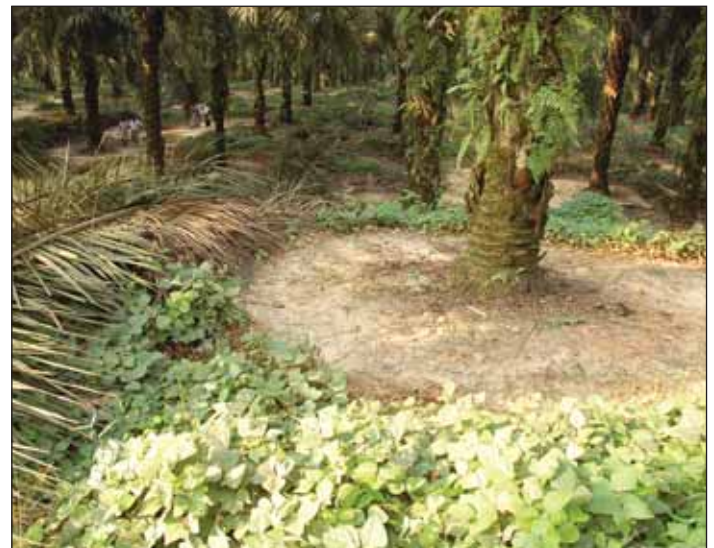
Oil palm plantation managed under the BMP program developed by IPNI SEAP. The weeded circle surrounding the palm as well as the frond pile stack (on left) are clearly visible.

K as the KCl, was produced by burning empty fruit bunches (EFB). The trial was conducted in a field that had been planted in 1980 with 143 palms/ha, and treatments ran from 1990 until 2001. In 1989 and 2002 (before and after treatments), soil samples were taken from each plot (0 to 0.2 m depth). Each sample was a composite of five sub-samples. The sample pits were located in the corners and the middle of the plot, exactly between two palms (equivalent to the BP zone in Figure 1 ). This zone received some fertilizer, with most of the remainder falling on the frond pile (FP) ( Figure 1; Photo ).