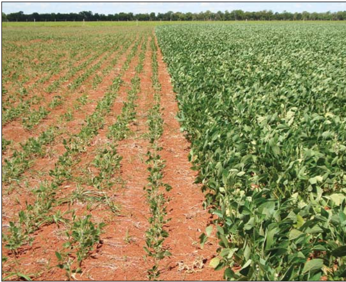
Dramatic contrast between two soybean fields where the only difference was the lack of application of P and K in the first year of production in a typical clay Cerrado soil in Mato Grosso State, in the Midwest region of Brazil.

such as enzyme activation, water and energy use relationships, translocation of assimilates, and protein synthesis. So, a short K supply causes a large number of problems in the plant.