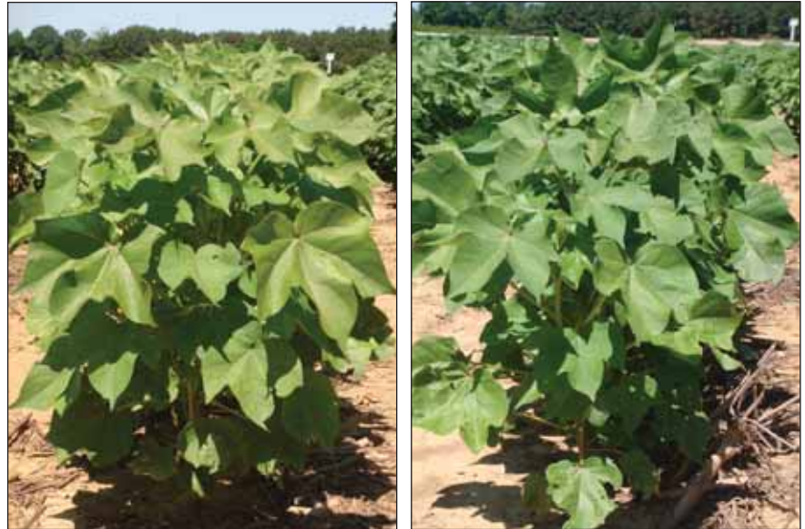
Figure 1. Cotton plants fertilized without S (left) and 30 lb S per acre (right).

Sulfur deficiency symptoms gradually appeared in the zero-S plots by about 40 days after planting each year. Plants without S fertilization showed classical S deficiency symptoms, such as pale green to yellow leaves in the upper part of plant, while 30 lb S/A treated plants grew normally ( Figure 1 ). These symptoms became less apparent as the crop grew larger and began to set fruit at about 70 days after planting.