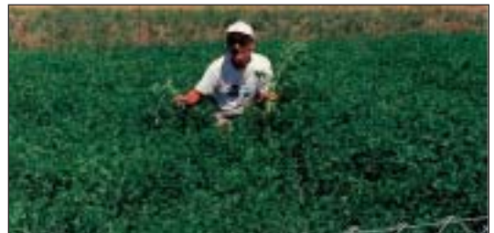
Phosphorus fertilization increased alfalfa forage production in this Argentina study. Apparent recovery of P was high in the year of application and diminished with time.

Despite this residual effect, the treatment supplying the highest one-time P rate (100 kg P/ha) became less productive than annual fertilization after the second year ( Table 1 ). It should be noted that forage production also showed a gradual decline throughout the study years, independent of P treatment. This could be attributed to restricted soil water availability and other nutrient deficiencies such as sulfur (S) or boron (B), as was previously found in alfalfa by Fontanetto (2000) and Carta et al. (2001b).