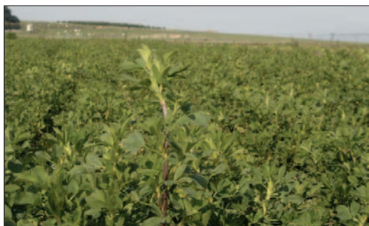
Alfalfa production has great potential in the pampas region of Argentina, but P fertilization is an important consideration.