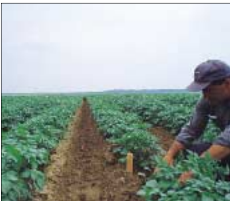
Researchers are seeking tools for development of P fertilizer recommendations that optimize potato yields and minimize risk of water contamination.

The environmental risk of loss of P from the soil has been assessed in the Netherlands from the degree of P saturation (DPS), computed as P/(Fe+Al) from molar concentrations of oxalate-extractable P, Fe, and Al. Recently, the ratio of P/Al in M-III extracts was found to correlate closely