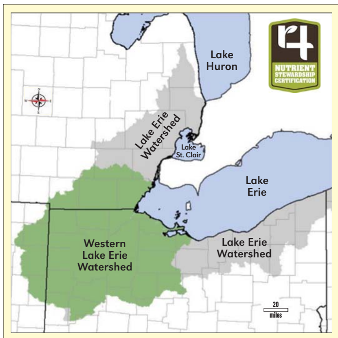
Figure 2. Much of the western Lake Erie watershed drains into the western basin of Lake Erie, which experienced increasing algal blooms from the mid-1990s to 2015.

of fertilizer, and conservation tillage are identified as possible contributors to the trend in increased losses, but there are few consistent datasets on the frequency of these practices across the watershed over the time period.