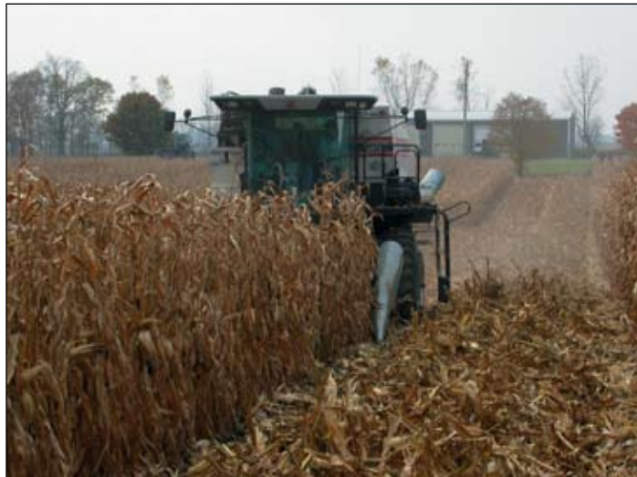
For the field scale research on sustainable intensification, this photo of 2004 harvest shows an AGCO R42 combine equipped with a Juniper Systems Inc. High Capacity Grain Gauge.

Yield increases in response to the management levels imposed were modest. While the differences were significant statistically ( p < 0.05 ) and indicated interesting changes in corn