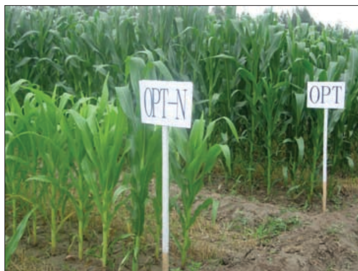
Maize was most limited by N at some sites (foreground), but analysis of soil test -based OPT treatments (background) found lower than optimum N use efficiency.

It should also be noted that yield potential in maize is, to a large degree, determined by factors such as solar radiation, temperature, moisture, and nutrient supply during grain filling, long after most of the N has been applied. Hence, for optimal