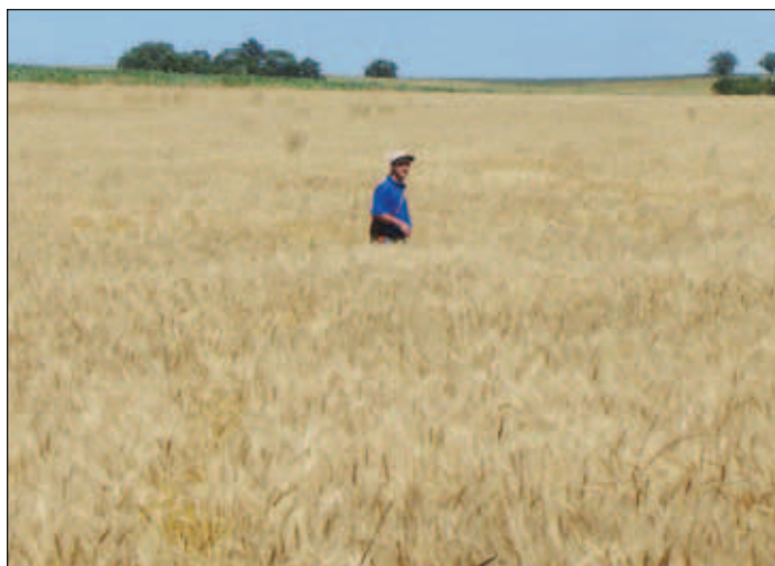
Wheat experimental field at EEA INTA Paraná (Entre Ríos).

variability of NDVI determinations for wheat and maize are obtained with 4 to 6 sensor units for standard fertilizer applicators. Also, NDVI variability decreases as crop development progress.