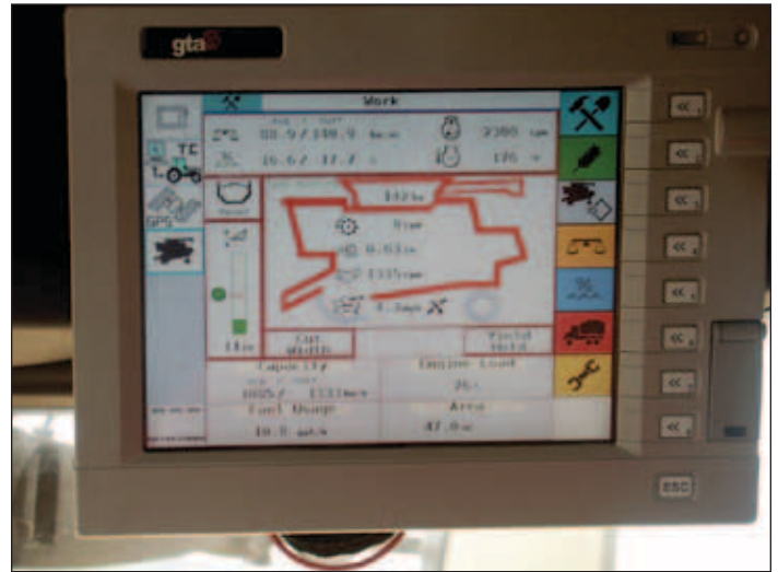
An example of a precision ag display mounted inside the cab, providing real-time performance parameters to the operator and the ability to collect various data.

First, there should be a clear objective in mind when adopting PA technologies and/or practices. Just as PA allows growers to address site-specific production issues, the reason for getting into precision agriculture will also vary from grower to grower. Is the goal to be more efficient with inputs? Better on-farm record keeping? Are there needed management