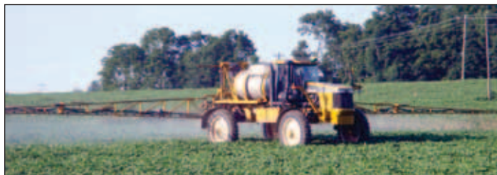
Illustration of a sprayer equipped with automatic section control technology which turns boom sections or individual nozzles on/off as the sprayer moves through the field. The sprayer uses guidance technology to minimize overlap and skips.

A yield monitor with GPS is used on a grain combine to geographically map yield data across the field. Yield maps provide a 'report card' for a producer by providing feedback about crop production and management.