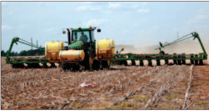
The crop is planted using auto-guidance technology.

tasks) as a major reason for adopting this technology. While the adoption of yield monitors coupled with GPS has been low in Alabama, growers are quickly starting to understand the advantage of yield maps to not only evaluate current and new management practices, but also as a data source for development of site-specific management strategies (i.e. management zones, variable-rate seeding, nutrient prescription maps, etc.). The survey also suggested that growers view grid and zone soil sampling and variable-rate application technology as having significant potential to provide cost savings and yield benefits.