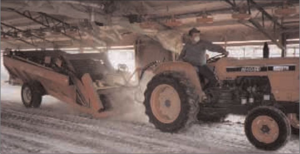
Alum spread on litter in poultry houses offers several benefits.

Ammonia volatilization results in high levels of \text{NH}_3 gas in the atmosphere of poultry houses, which can be harmful to the health of birds and farm workers.