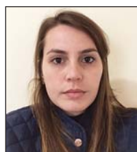
Shively Los Galettos