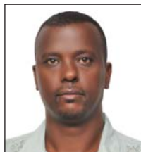
Bayou Bunkura Allito