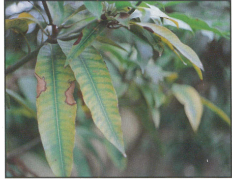
MAGNESIUM-deficient mango plant in western Guangdong province.