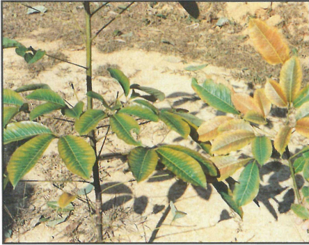
MAGNESIUM-deficient rubber plant in western Guangdong province.