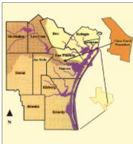
Figure 1. Odem Ranch Watershed location.

Sixteen pesticides (10 herbicides and six insecticides) were detected with varying degrees of frequency in runoff samples. The